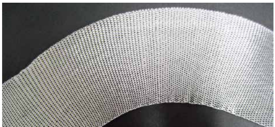
Close-up of the woven ribbon structure