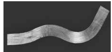
Curvature of the continuous shape ribbon can take any direction, also S-shapes