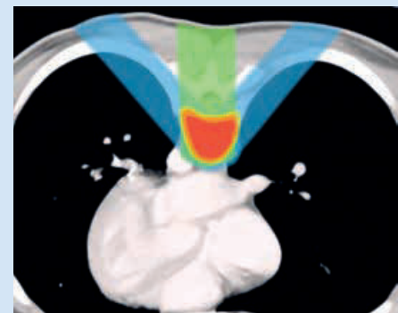
Fig. 2: Dose plan for radiotherapy - schematic