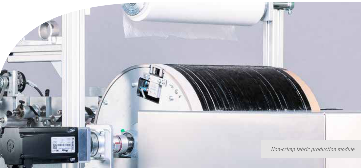
Non-crimp fabric production module