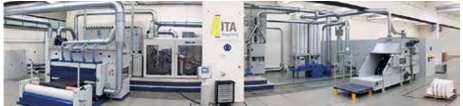
Compact line at ITA: carbon fibre waste to semifinished products for hybrid, thermoplastic and thermoset materials

end products. The high degree of variation, which results from process of “web based composites” is a system benefit which will enable further interesting applications. In special cases, yarns and other products like patch-based surfaces, will complement the areas of application.